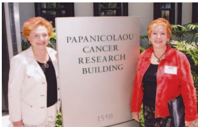
Pap Corps volunteers stand proudly at the Papanicolaou Cancer Research Building on the Miller School of Medicine campus.